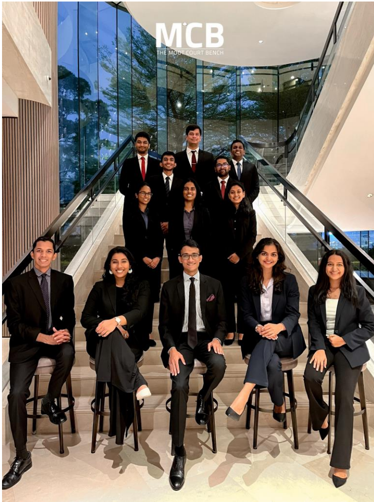
The Sri Lankan Vis Teams and Coaches at the 20 th Willem C. Vis (East) International Commercial Arbitration Moot in Hong Kong.