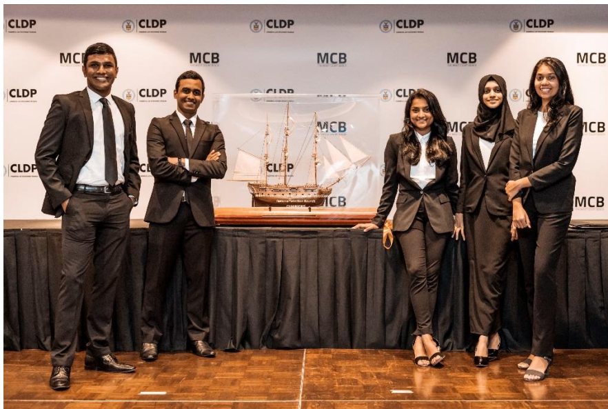
Sri Lanka Law College Team, Winners of the Vis National Rounds 2020